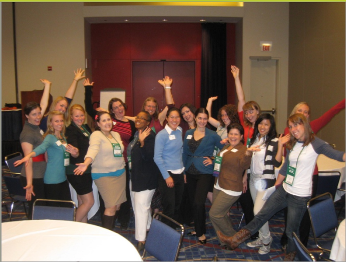
Governors and Region Collegiate Teams (RCT) from Regions A, B, and J; Photo taken at WE11